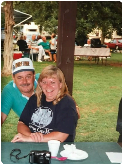
camping at Roundout