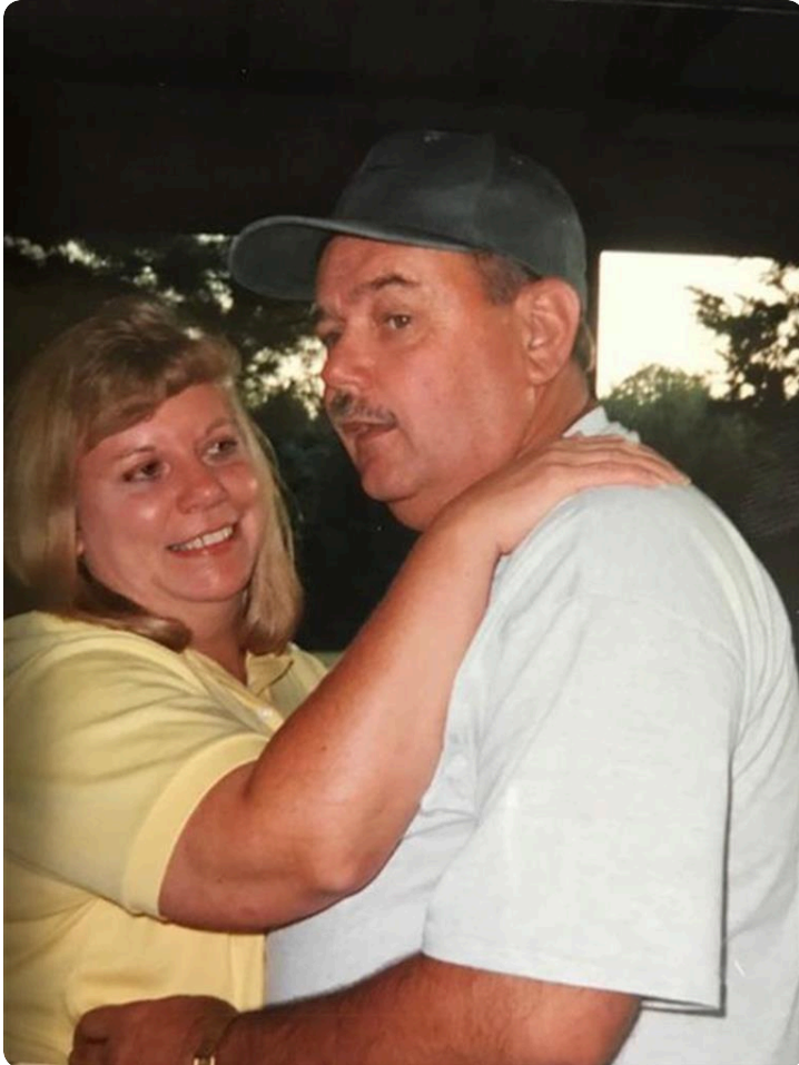
Labor Day party in the Pavillion