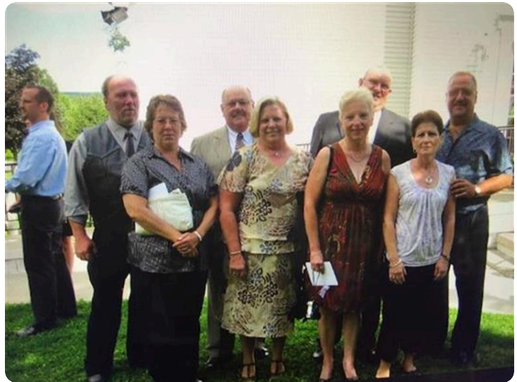
The crew celebrating a Varana wedding